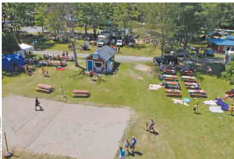
An aerial shot of the Seattle-area's Bloody Thursday picnic.