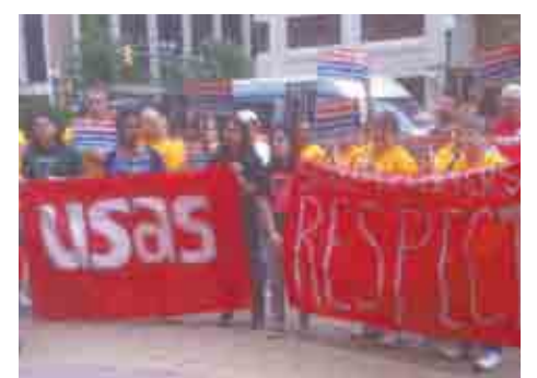
United Students Against Sweatshops, a nation-wide network of college students, rally in Harrisburg, PA before the Rite Aid shareholders' meeting.

The day before the annual meeting, Rite Aid union leaders convened a national summit to share information and develop common strategies