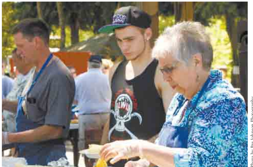
Volunteers at the Portland picnic served food to ILWU members and their families.