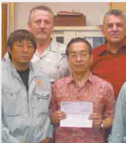
Solidarity for Japanese dockworkers page 2