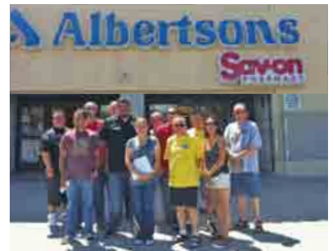
At end of July, Local 26 members at the Rite Aid distribution center in Lancaster adopted a local Albertson store.

Delegations of 2-3 ILWU and Inland Boatmen's members went to their 13 adopted stores wearing union t-shirts. They asked to speak with the managers at the front of the stores