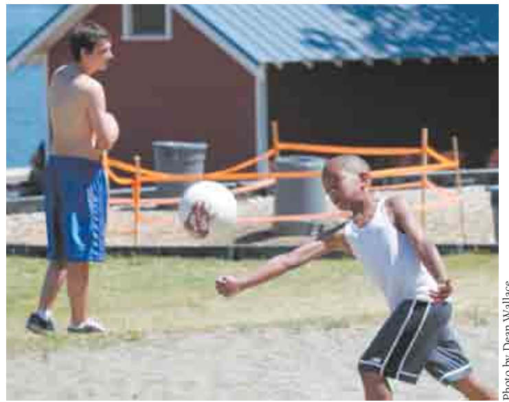
Kids and adults took in some beach volleyball game at the Seattle-area picnic.