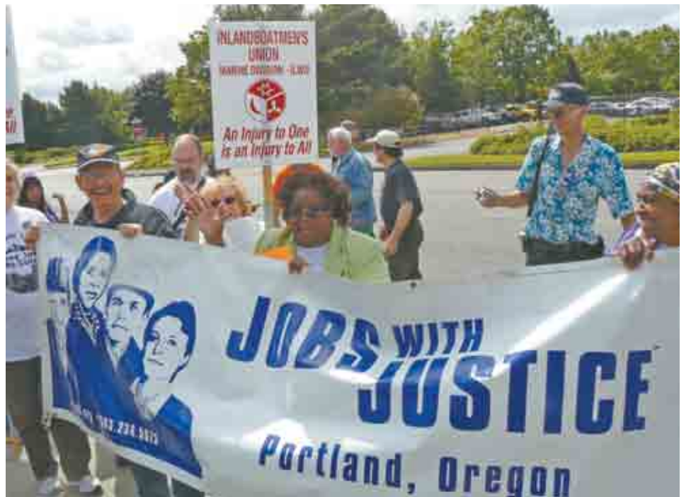
Portland rising: A coalition of labor and community groups rallied behind Georgia-Pacific workers at Kelly Point.