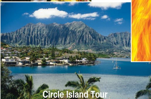
Circle Island Tour