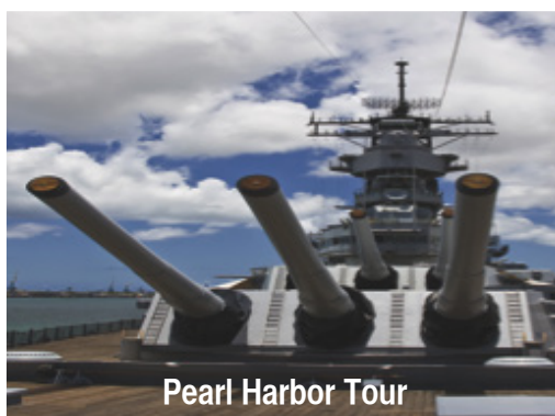
Pearl Harbor Tour