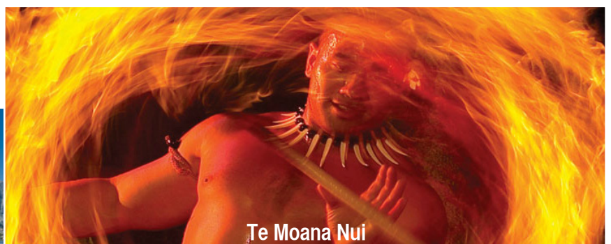
Te Moana Nui