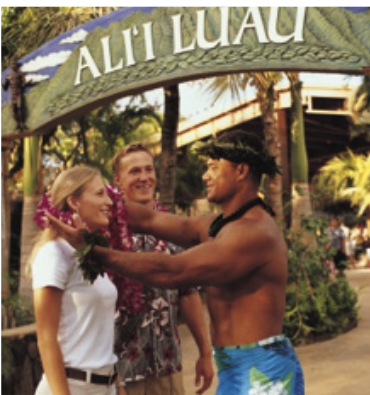
Polynesian Cultural Center