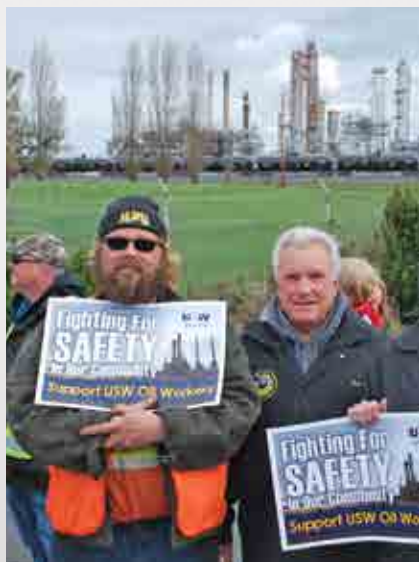
Protecting the union and the environment page 4