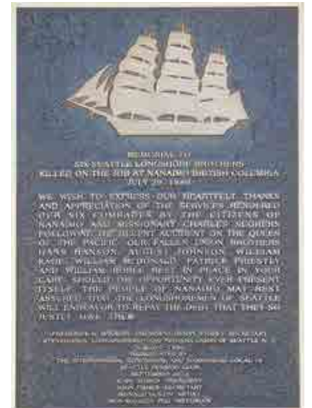
Scores of ILWU members and pensioners attended the rededication of the plaque that marks the death of longshore workers killed in the 1886 coal dust explosion in the Port of Nanaimo, British Columbia.

At the luncheon, it was noted that another longshore tragedy happened in Vancouver, British Columbia, on March 6, 1945. The steamship Green Hill Park blew up and killed six longshoremen and two seamen. Somehow, whisky, flares and sodium chlorate