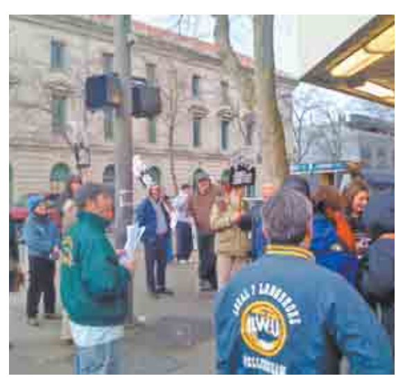
Bellingham, WA: Dozens of activists, including International Longshore and Warehouse Union (ILWU) members and retirees, members of Amalgamated Transit Union Local 843, JwJ and United for National Health Care, and students from Western Washington University and Whatcom Community College rallied at a Bellingham, WA Rite Aid store.