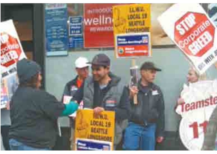
Seattle, WA: Seattle Jobs with Justice led a group of 30 supporters in an action at a downtown Rite Aid store. Participants represented a variety of organizations, including: ILWU Local 19, the Inlandboatmen's Union, the International Transport Workers' Federation, IATSE, Teamsters Local 117, the Asian Pacific American Labor Alliance, the Coalition of Labor Union Women, the Alliance for Retired Americans, and the IWW.