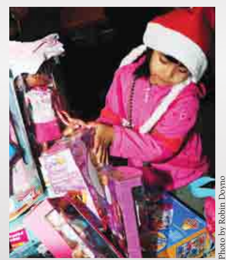
ILWU members up and down the coast pitched in to make sure struggling workers in their communities had a happy holiday season. page 3