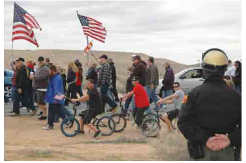
A special screening of the new documentary film about ILWU members by Joan Sekler