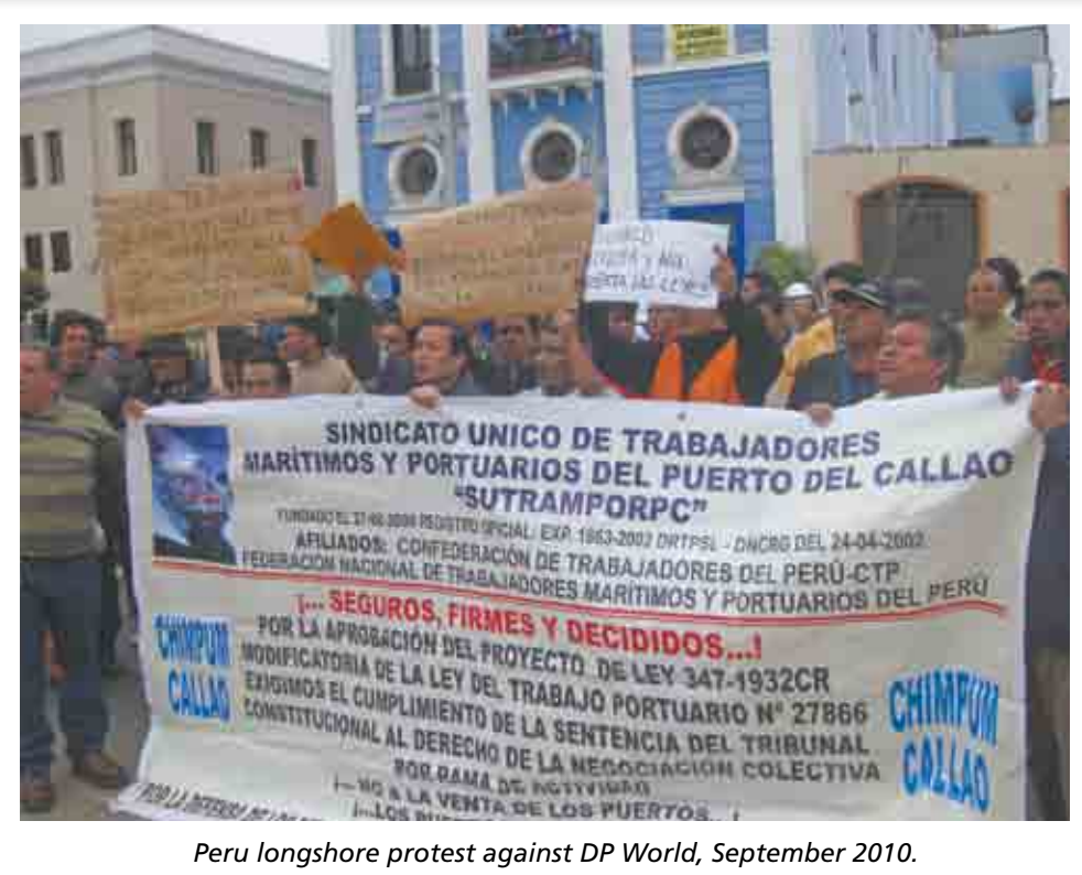
Peru longshore protest against DP World, September 2010.