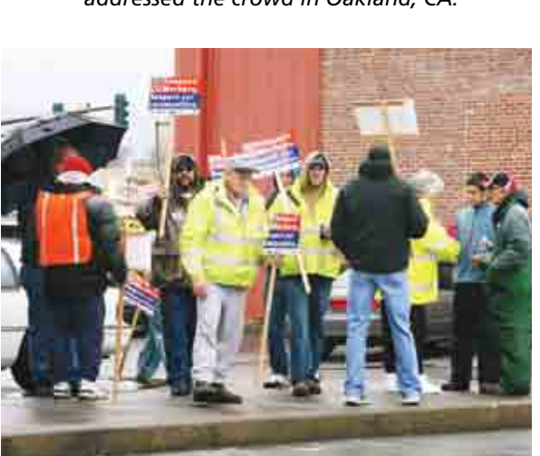
ILWU members in Aberdeen demonstrated at a Rite Aid store.