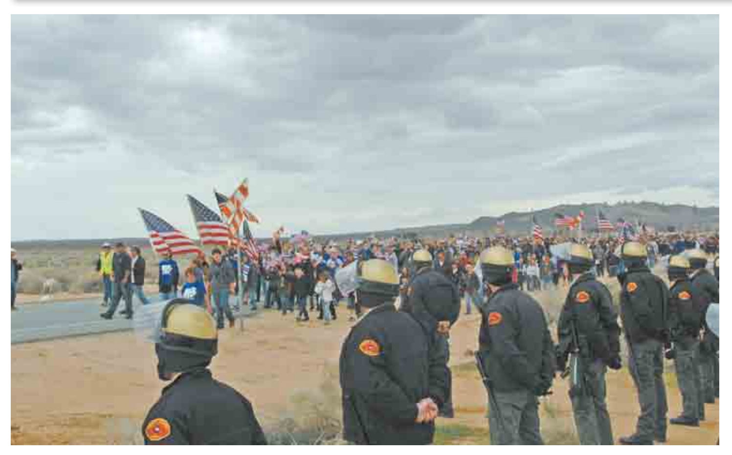
Local 30s members took on and defeated one of the largest mining companies in the world with the help and solidarity of labor unions and other community groups.