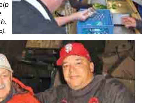
Locals 10, 34 and 91 joined with Farley's coffee shop, Goat Hill Pizza and Blooms Saloon to help the San Francisco Fire Department Local 798 gather over 2,000 toys for needy children in San Francisco.