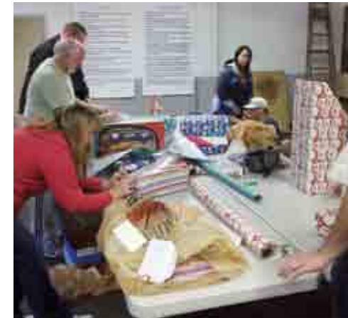
Local 19 volunteers wrapping presents for the toy drive.