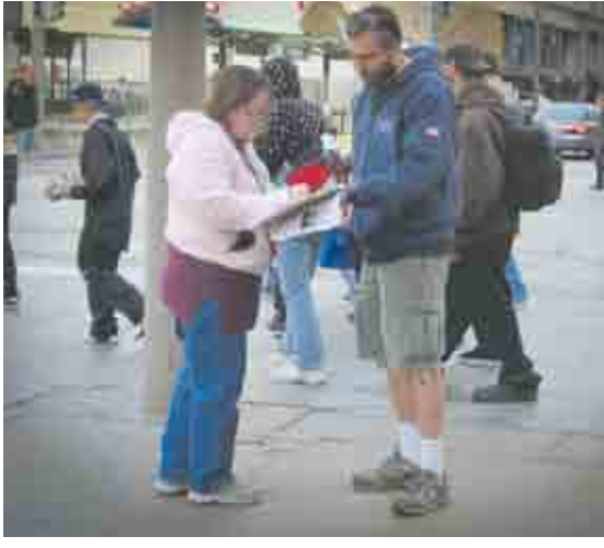
Denver, CO: Colorado JwJ and the state AFT organized an action outside the Rite Aid store at the busy 16th Street Mall in Denver. The group educated customers, passed-out 600 flyers and collected 4 pages of signatures on the letter of support that was delivered to store management.