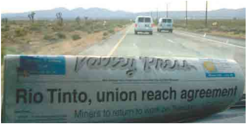
Bye scabs: Scab workers leaving Boron after Local 30s members defeated Rio Tinto's lockout.

The David vs. Goliath story is told in the new documentary by filmmaker Joan Sekler: "Locked Out - The Story of the Boron Miners' Struggle." The film debuted in Boron to an audience of Local 30 families and neighbors in December. The film will also be shown on Wednesday, February 16th at the Warner Grand Theater in San Pedro at an event sponsored by Locals 13, 63 and 94. Contact the locals for more information. DVD copies of the film can be purchased from the filmmaker at http://www.lockedout2010.org