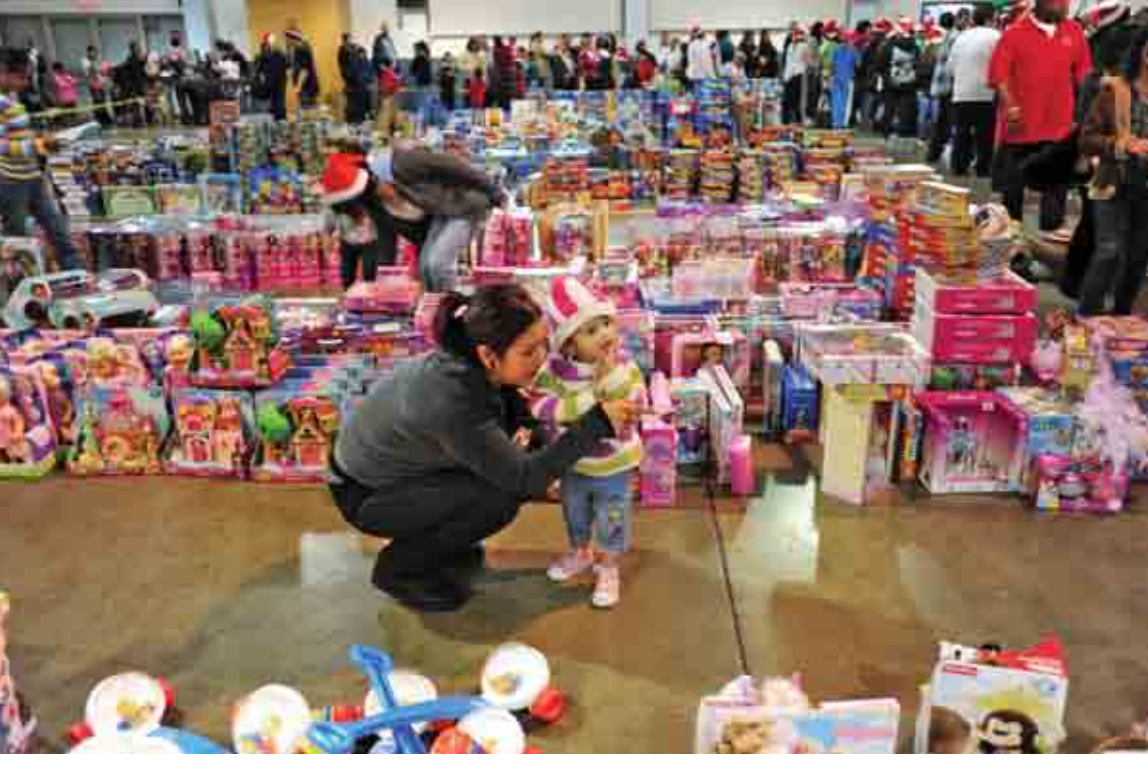
Southern California ILWU members' generosity benefited 1,500 local children.