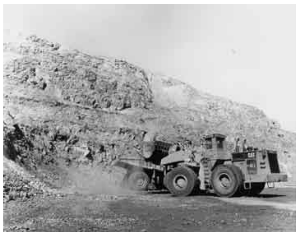
ILWU members operate heavy equipment in Boron's open-pit mine.

In 1967 I got drafted. I'd been at Borax for eight months. Since I was in the military, I missed Local 30's 1968 strike. I served with the Army's 82nd Airborne Division and spent a year in Vietnam. We got sent over there in December 1967, just in time for the Tet Offensive of early 1968. Tet was when the North Vietnamese Army overran the whole country. You had fire fights and jungle stuff. You got kind of messed up in the head by the time you got home. It took you a while to get squared away.