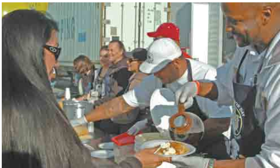
Local 13's Labor Day breakfast: Now in its 11th year, the annual breakfast would not happen without the hard work of ILWU volunteers.

the solidarity efforts of ILWU members in the fight to protect the collective bargaining rights of public employees under assault in Wisconsin and other states.