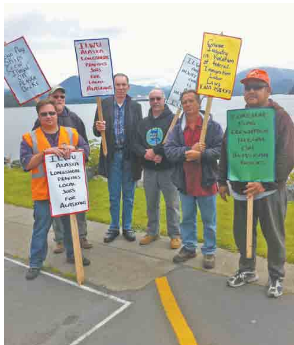
ILWU members in Sitka, Alaska protest cruise ships that are refusing to hire ILWU longshore workers to perform local work.