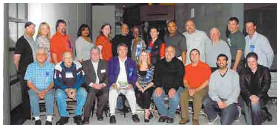
ILWU Local 23 members received the Tacoma City of Destiny Award for years of committed service to the Tacoma community.

The city of destiny award is a program is spearheaded by a City Council appointed Citizens Recognition Committee comprised of local community leaders from a broad array of backgrounds and areas of expertise. Since 1987, the City of Tacoma has honored over 200 outstanding volunteers through its City of Destiny Awards program. The Citizens Recognition Committee of individuals appointed by the City Council selects the winners.