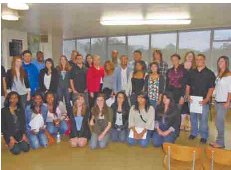
On July 27th, the Bay Area Longshoremens Memorial Association presented $28,000 in scholarships to 50 students at a reception held at the Local 10 hall in San Francisco.