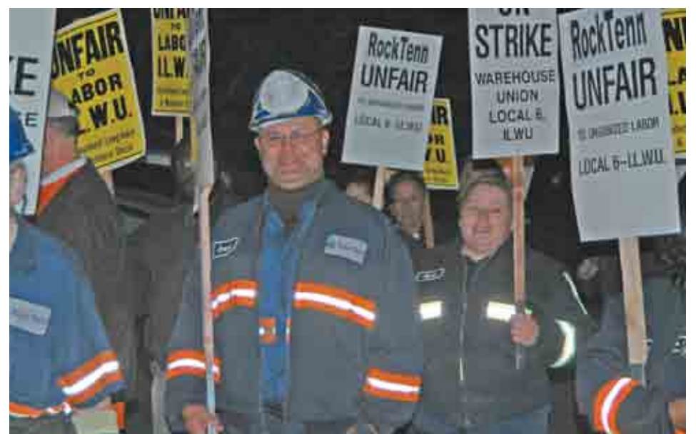
Early morning picket: RockTenn workers in Oakland voted to strike just after 4 am on Aug 30th. They ratified a new contract on Sept. 11th.

After several hours of picketing, the workers voluntarily voted to end their strike and return unconditionally to work.