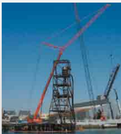
Historic Islais Creek Copra Crane moved landside. page 7