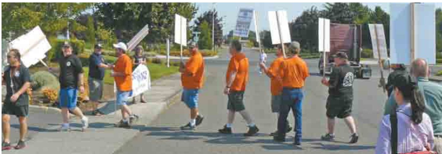
Striking fast and hitting hard: On September 9th, members expressed their objection to the company's continued unlawful behavior by walking off the job in a "lightning strike." Every single worker in the warehouse joined the picket line.