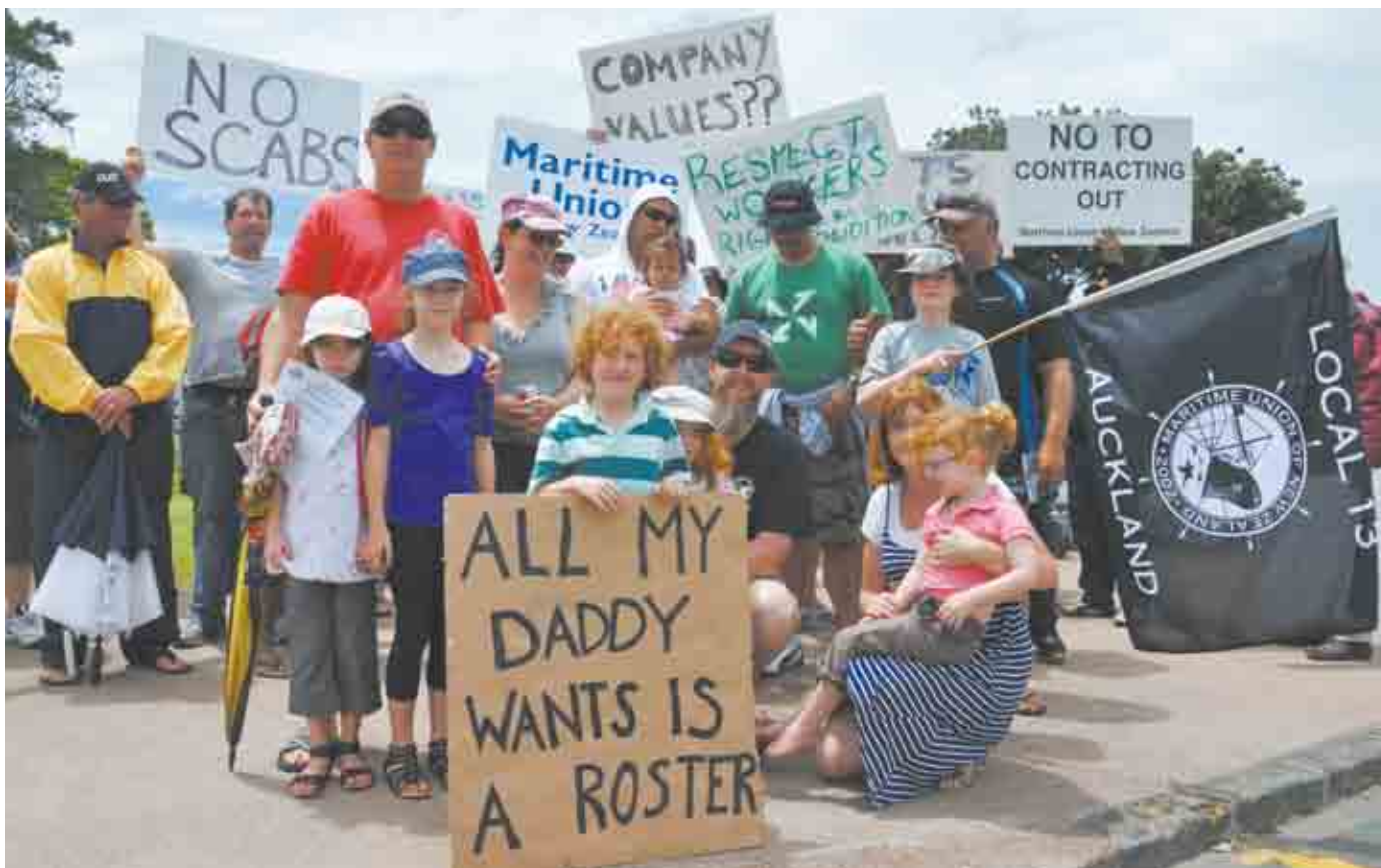
Fighting for good jobs, families and communities: The sacking of nearly 292 dockers by a private port operator in Auckland has triggered a worldwide solidarity response by the ILWU and other unions to support the Maritime Union of New Zealand.