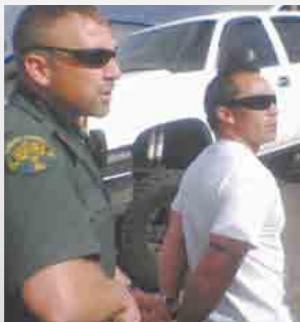
ILWU sues more Cowlitz County officials. page 3