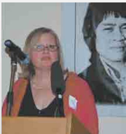
Assassination of Local 37 officers remembered on 30th anniversary. page 3