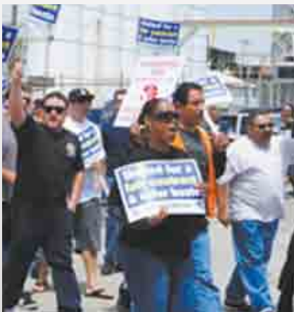
SoCal ILWU Locals rally behind IBU tug and barge crews. page 3