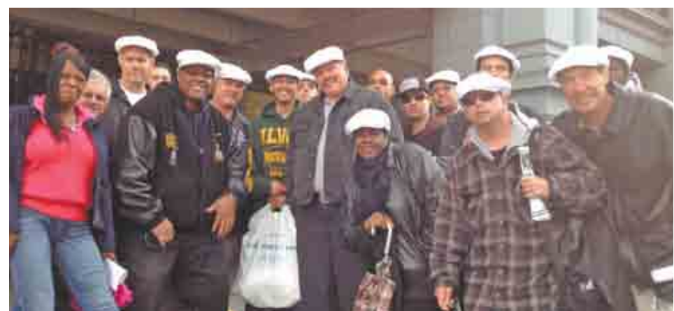
Standing Strong at the Port Commission: ILWU members mobilized for a San Francisco Port Commission meeting to protect ILWU jurisdiction and jobs.