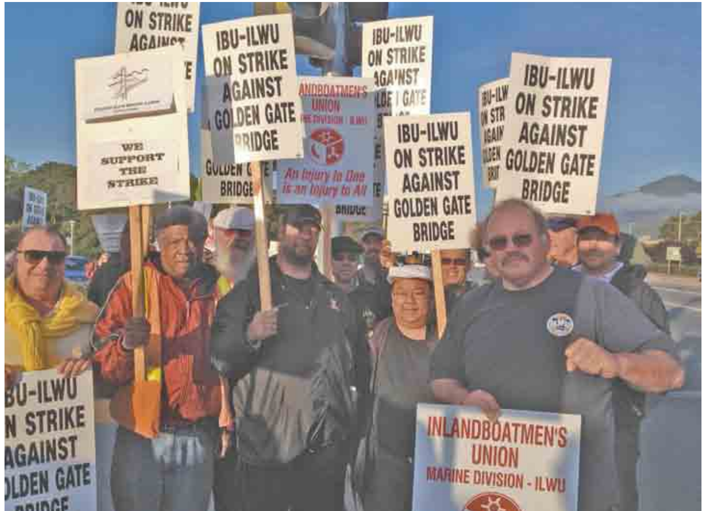
On May 1st, ILWU solidarity supporters joined IBU members working for the Golden Gate Ferry Service who staged a half-day strike that shut down ferry service from Marin to San Francisco. The workers of the Golden Gate Labor Coalition kept pressure on the District by staging several high profile actions during the previous months.