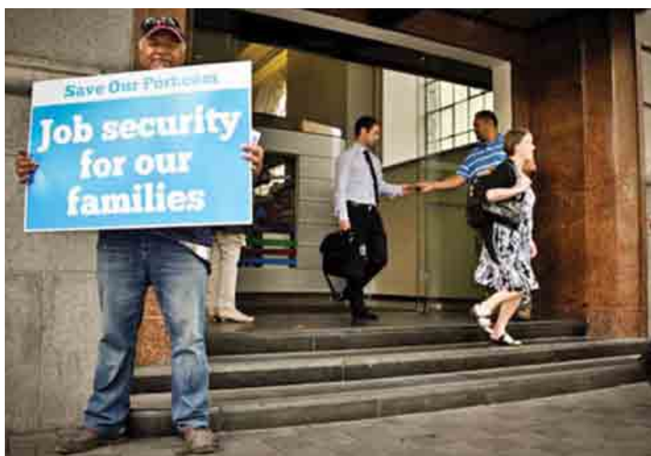
Community outreach: Members of the Maritime Union of New Zealand hand out flyers to the public to educate them about their fight for good jobs.