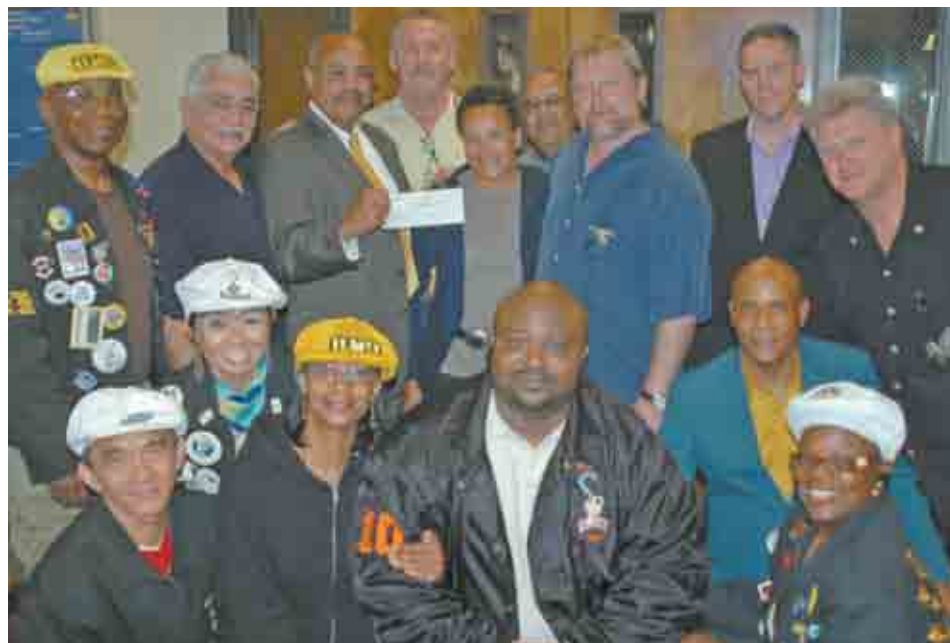
Answering the call: The Coast Longshore Division donated generously when they heard the call for support from the Booker T. Washington Community Service Center.