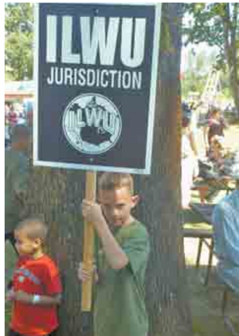
Portland Picnic: The Bloody Thursday celebration in Portland showed that it is never too early to start learning about the importance of defending ILWU jurisdiction.

The Southern California Bloody Thursday celebration began at 10 am with a memorial service at Roosevelt