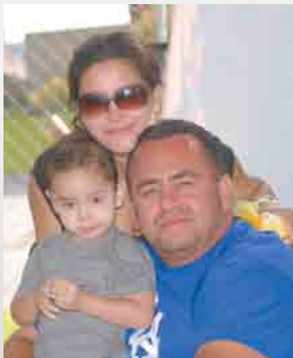
Bloody Thursday was celebrated coastwide on July 5. page 4