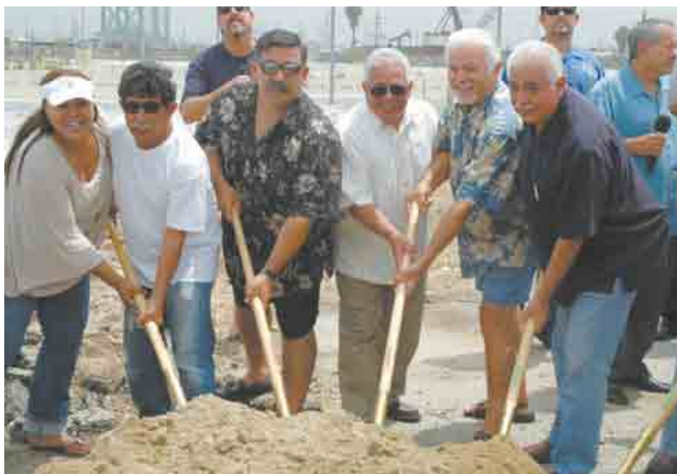
All hands on deck: Local 13's new Dispatch Hall will be a modern "green" facility that will be able to accommodate the dispatching needs of the Local's 7,000 registered longshore workers.

The ILWU tradition of union-managed dispatch halls was a key victory won through a series of bitter struggles, climaxing in the 1934 coast-wide waterfront strike in which 7 workers were killed and many more seriously injured. Prior to that victory, longshore workers suffered under a "shape-up" system controlled by employers that included blacklisting, bribery, discrimination and favoritism. Employers tried but failed to eliminate the ILWU dispatch halls during the waterfront strike of 1948 strike that lasted 95 days.