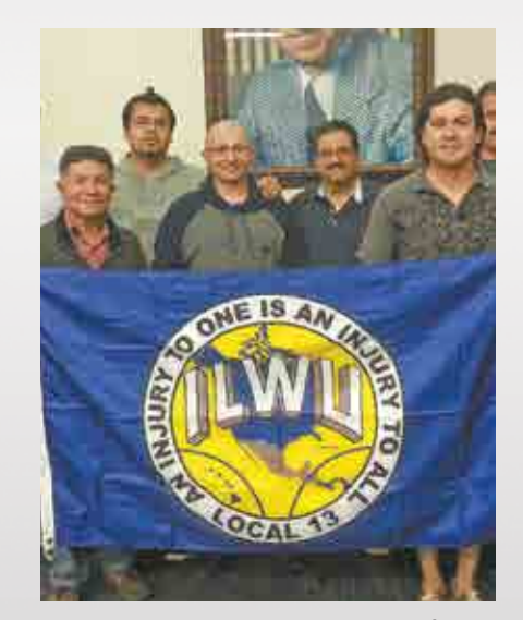
Settlement wins back wages for Local 13 members. page 3