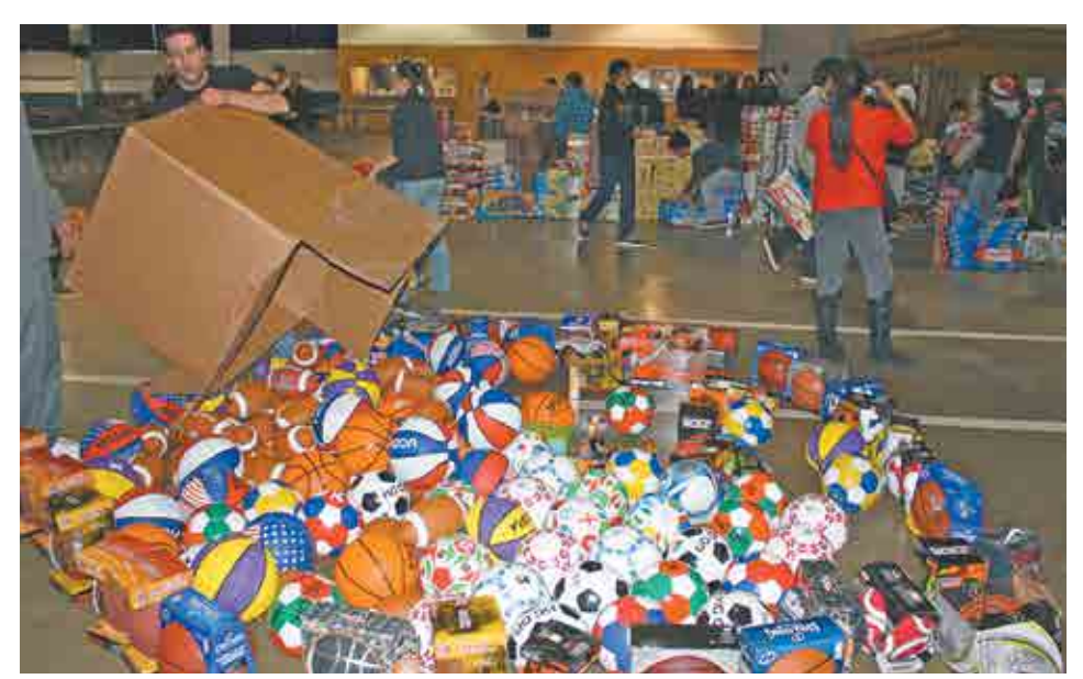
Thousands of smiles in the Southland: The Sothern California ILWU Children's Party helps approximately 3,000 children every year.