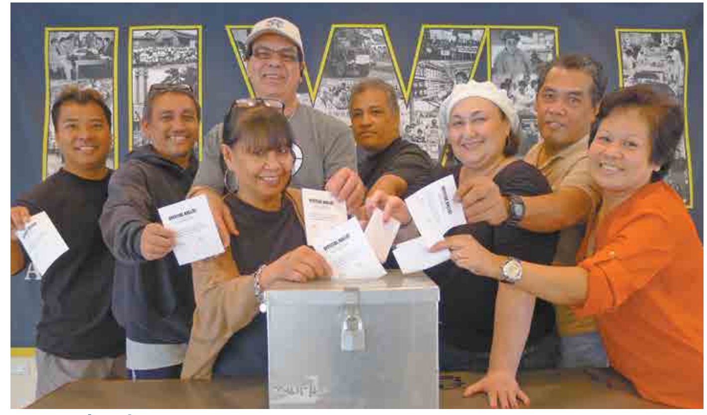
Long road to victory: After a decade of struggle, workers at the Pacific Beach Hotel won their first contract agreement.