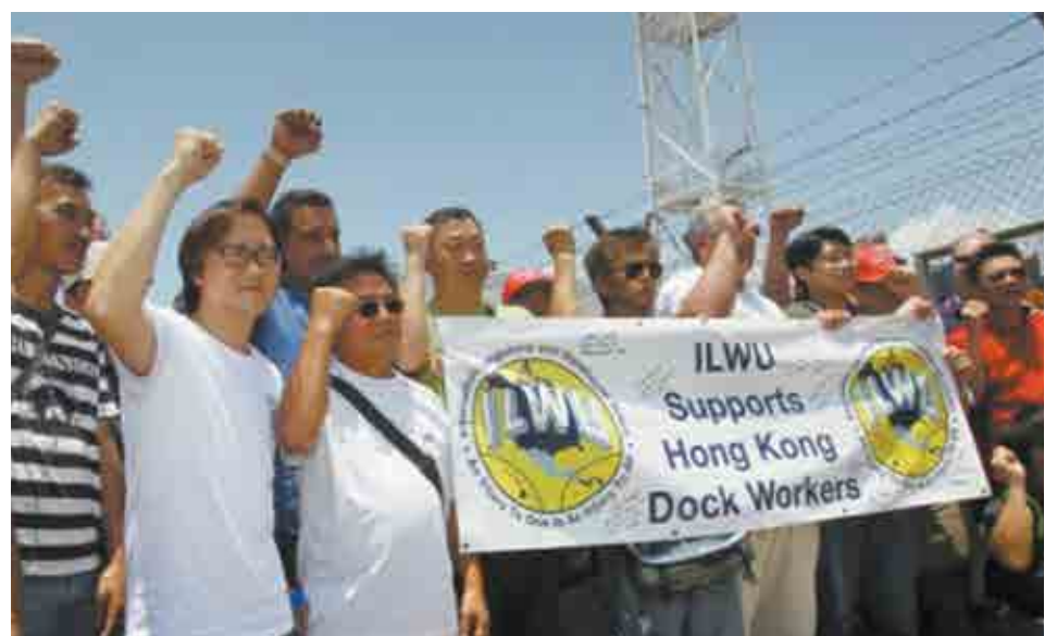
Standing with Hong Kong dockers: The ILWU solidarity delegation joined the Hong Kong dock workers on the picket line as they fought for fair wages and working conditions.

On May 20, the Union of Hong Kong Dockers confirmed that 80% of