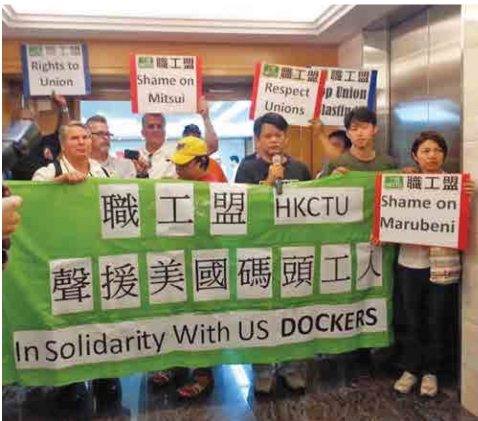
International solidarity: Leaders from the Union of Hong Kong Dockers and ILWU members joined forces to visit the Hong Kong offices of the Japanese corporation Marubeni, owner of Columbia Grain in Portland, and Mitsui, owner of United Grain in Vancouver, WA. Both corporations have illegally locked-out ILWU members from export grain terminals – and both were told that their abuse of workers will trigger international solidarity.