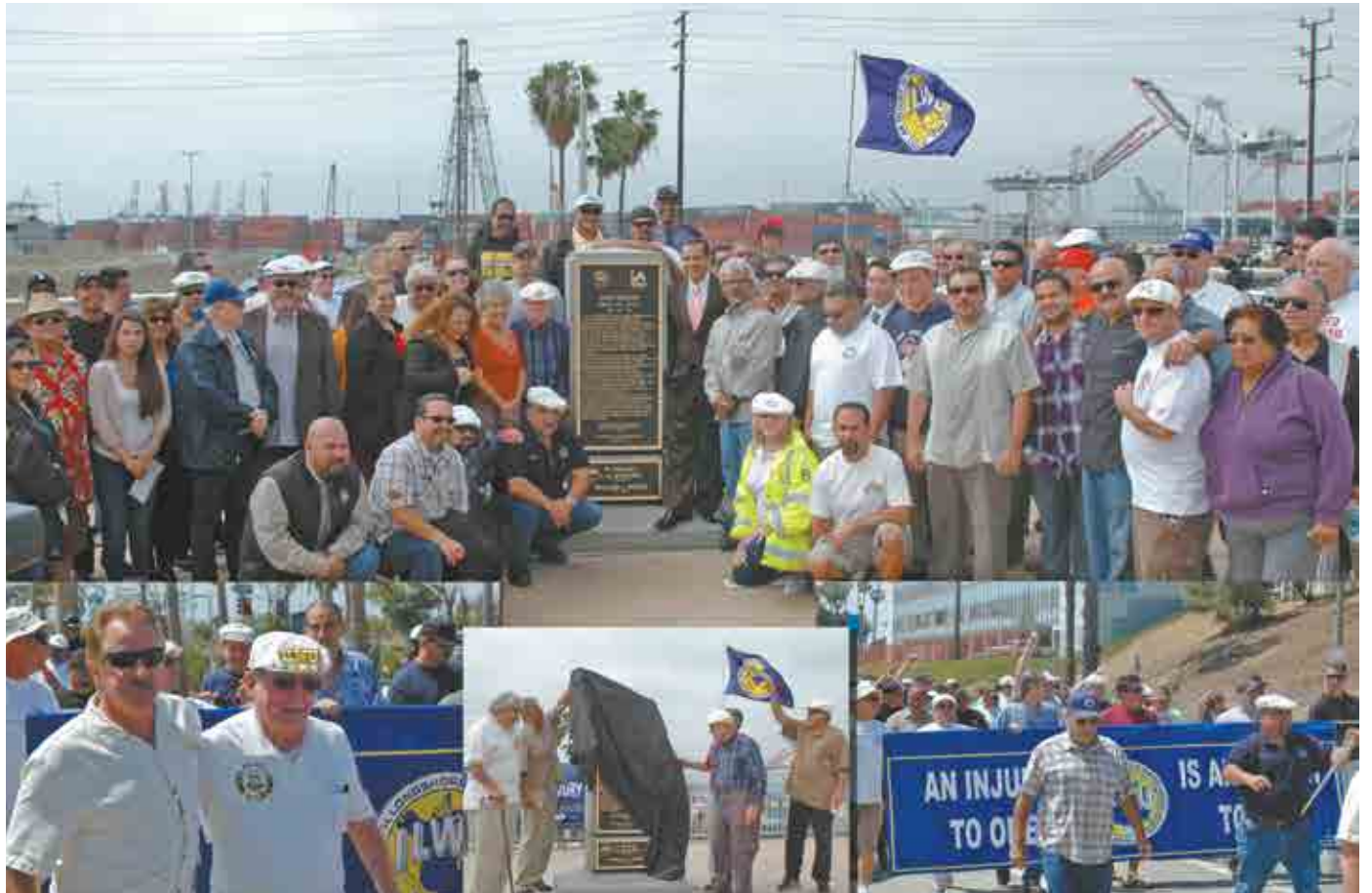
Re-dedicated: The ILWU family was joined by Los Angeles Mayor Antonio Villaraigosa on May 18 to re-dedicate a plaque honoring the 1934 West Coast strikes that gave birth to the ILWU.