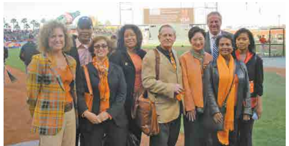
Play ball! Commissioners and staff celebrated the Port of San Francisco's 150th anniversary at a recent San Francisco Giants game.