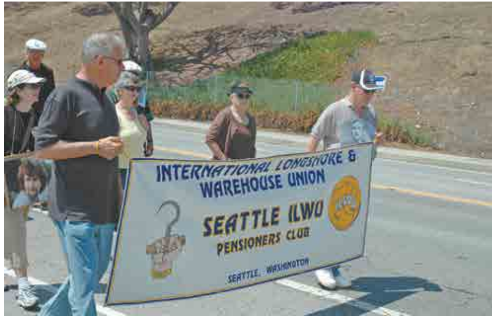
Northwest solidarity: A delegation of pensioners from the Pacific Northwest travelled to Southern California for the First Blood events.