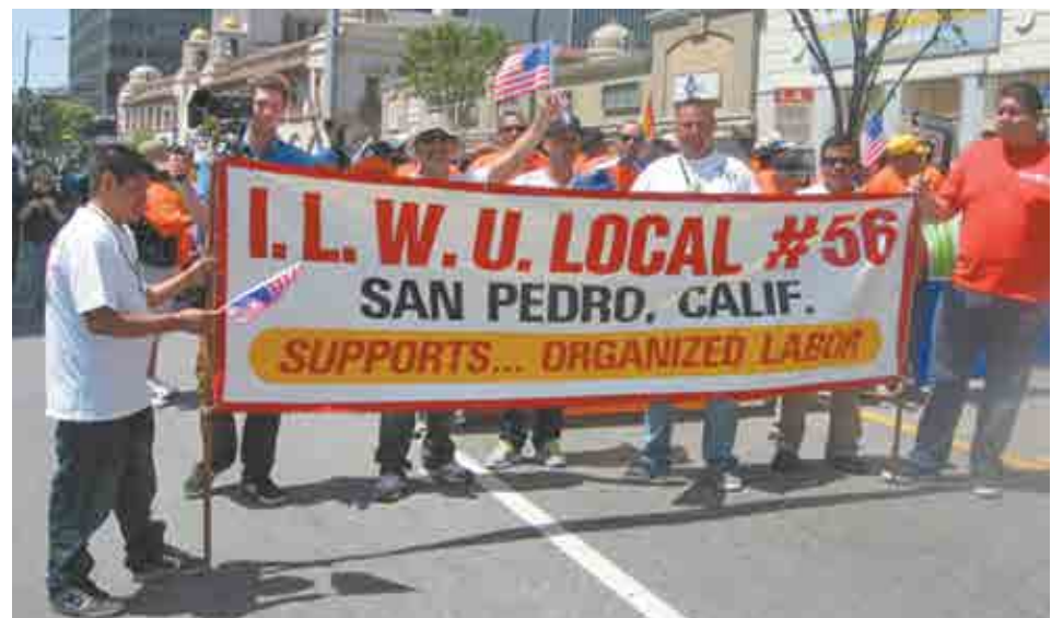
Marching for immigrant rights: Members of ILWU Local 56 joined thousands of workers, faith-based organizations and community activists at this year's May Day march in downtown Los Angeles. An estimated 30,000 marchers snaked their way through the 1.5 mile parade route ending at Olvera St. The demonstrators marched in support of comprehensive immigration reform.