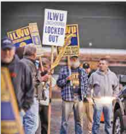
Foreign grain merchants continue lockouts. page 4