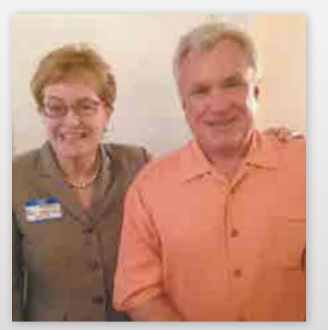
ILWU Legislative Conference aims for accountability. page 3