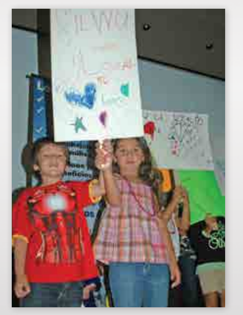
Local 56 shipscalers convention page 5