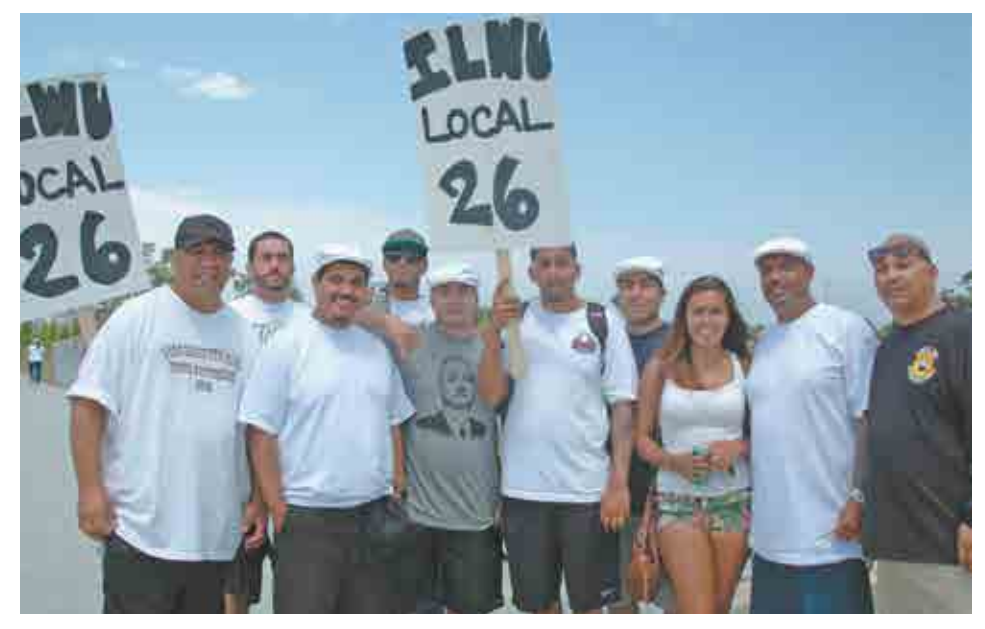
ILWU family: ILWU Local 26 members at the memorial service in Wilmington, CA.