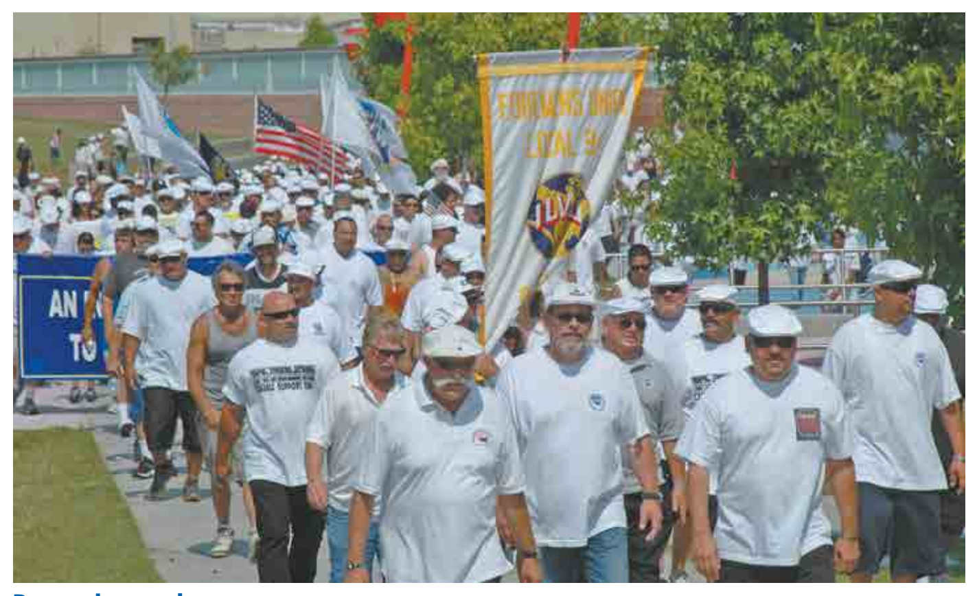
Power in numbers: ILWU members, families, auxiliary, pensioners and community members from throughout the Southland commemorated Bloody Thursday on July 5th by marching 5 miles from the Harry Bridges Memorial in San Pedro to the newly installed First Blood Memorial in Wilmington. An estimated 2,500 marchers filled the road as the somber procession headed toward the First Blood Memorial.

Postmaster: Send address changes to The Dispatcher, 1188 Franklin St., San Fran