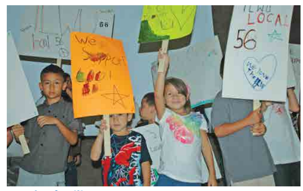
Para las familias: A los afiliados del Local 56 se les animó a que llevaran a sus familiares a la Convención celebrada el 27 de julio en San Pedro. Se ofreció cuidado de niños gratuito, además de una carne asada al mediodía para todos. Los afiliados de dicho Local expusieron la necesidad de mejorar sus condiciones de trabajo y proteger el medioambiente para las futuras generaciones.

os afiliados y líderes de ILWU asistieron a una convención entusiasta a finales de julio para apoyar a los afiliados del Local 56, conocidos como los "escaleros," que tienen un historia digna de orgullo y están preparándose para una fuerte lucha por su contrato en noviembre de este año.