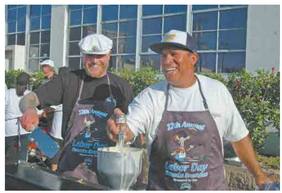
The Local 13 Labor Day breakfast served a hot meal to over 2,500 people to get the ready to honor the workers who keep the country moving.

The parade started at 10 a.m. at Broad and E Streets. Workers walked proudly behind union banners and flags with their families, accompanied by area high school marching bands, motorcycle clubs, and classic cars. They were led by a flatbed trailer of ILWU pensioners as the march made its way up Avalon Blvd towards Banning Park for a noon rally and picnic. Workers and their families were treated to hot dogs, hamburgers and plenty of cold water to help beat the heat that approached double digits.