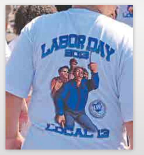
ILWU members celebrate Labor Day page 4