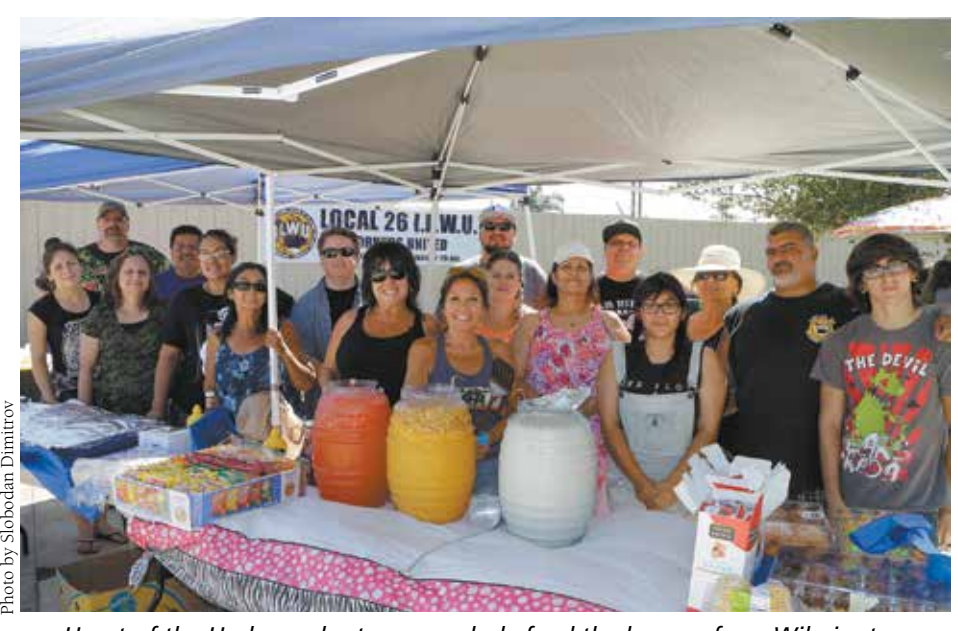
Heart of the Harbor volunteers regularly feed the hungry from Wilmington to Los Angeles's Skid Row.

"My 17 years in the union have provided me with so much support that made my turnaround and recovery possible," he says, adding that it has also expanded his perspectives, noting that he's been able to meet people from all over the world and get beyond the small-minded thinking and bigotry that came with life in a gang. "I now see that all of us have so much in common, instead of focusing on difference like I used to, about how people looked or talked. I am truly grateful to all of my union brothers and sisters who have shown me so much solidarity and positivity during my years on the waterfront."