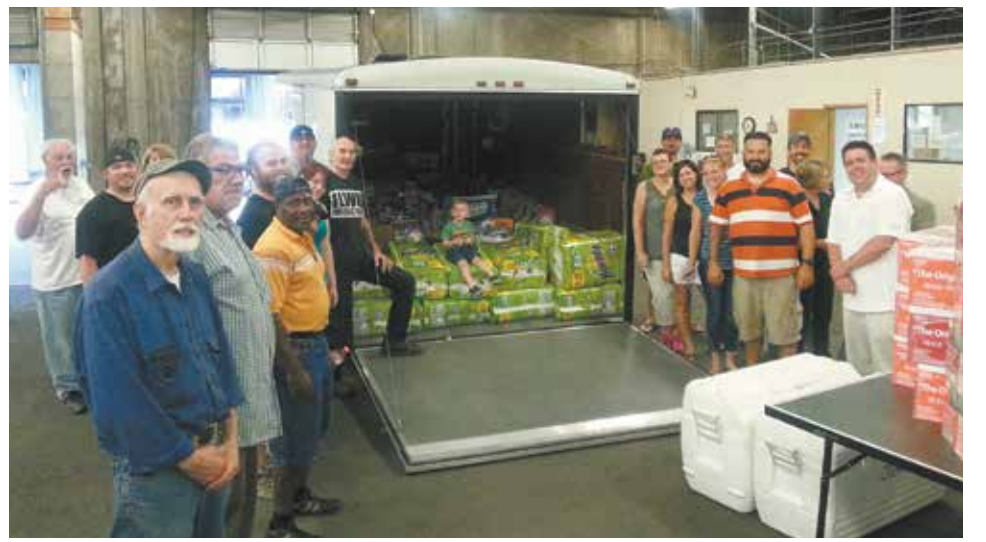
Packing supplies: Local 19 members, friends and family helped gather supplies around Seattle for farmers and ranchers hurt by wildfire in eastern Washington State. Local 19 helped raise half of $25,000 in donations for the effort.