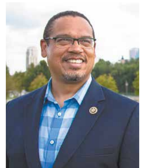
Minnesota Congressman Keith Ellison