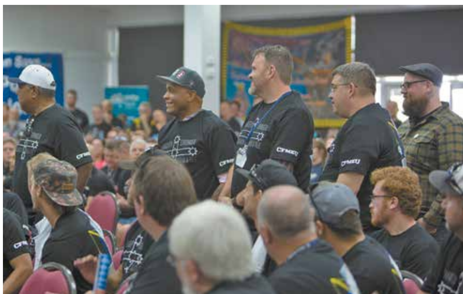
Line up: ILWU leaders were asked to stand and be recognized by their Aussie hosts.