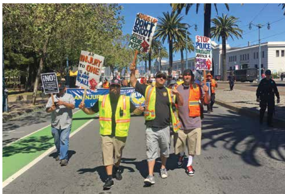
Bay Area support: ILWU members were among hundreds who marched in San Francisco to support immigrants and other causes on May Day. Longshore members reached agreement with waterfront employers to move their monthly “stop-work” meeting to May 1, allowing for a show of solidarity with other workers who marched and rallied across the country.