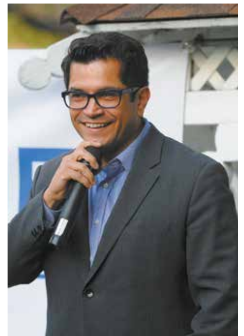
California Assemblymember Jimmy Gomez

The June frontrunner, Gomez, is backed by a coalition including the ILWU Southern California District Council, other labor unions and elected officials.