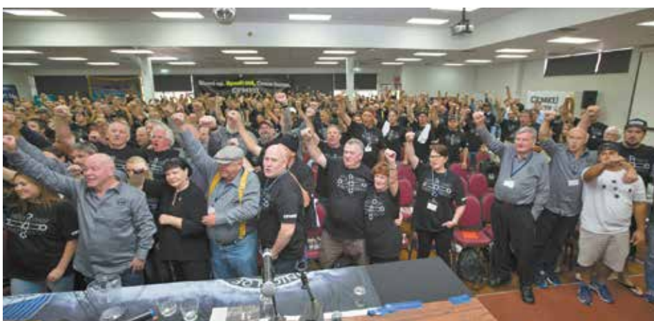
Unity chants: Australian union members are passionate, proud and loud.

"These unions understand that the working class has to fight in order to make progress," said ILWU President McEllrath. "The election victory in Western Australia is a good example of what it takes for working people to win."