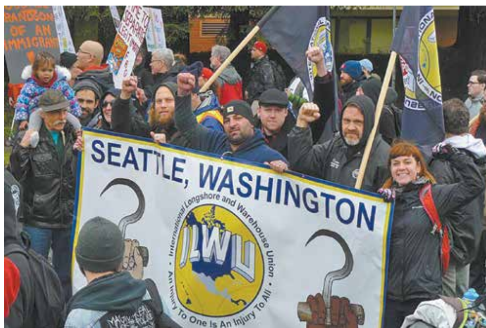
Puget Sound: After ILWU Local 19 members hung a banner from a crane in solidarity, members from Locals 19, 23, 52, and the Inlandboatmen’s Union of the Pacific (IBU, ILWU’s Marine Division) marched on May Day in Seattle with several thousand immigrants and refugees, indigenous people, union members, and community organizations.